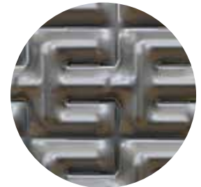
Free Flow plate

SonFlow's Free Flow exchanger series is an excellent choice for wastewater treatment applications. The deep channels enable highly viscous media to flow unobstructed. Our unique Free Flow plate pattern minimizes the risk of clogging and fouling, ensuring reliable operation. The Free Flow plate heat exchanger series is designed with a focus on high efficiency and operational reliability.