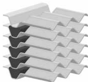
Free Flow Princip

Every detail is designed carefully to ensure optimal heat transfer, reduced maintenance costs and decreased downtime.