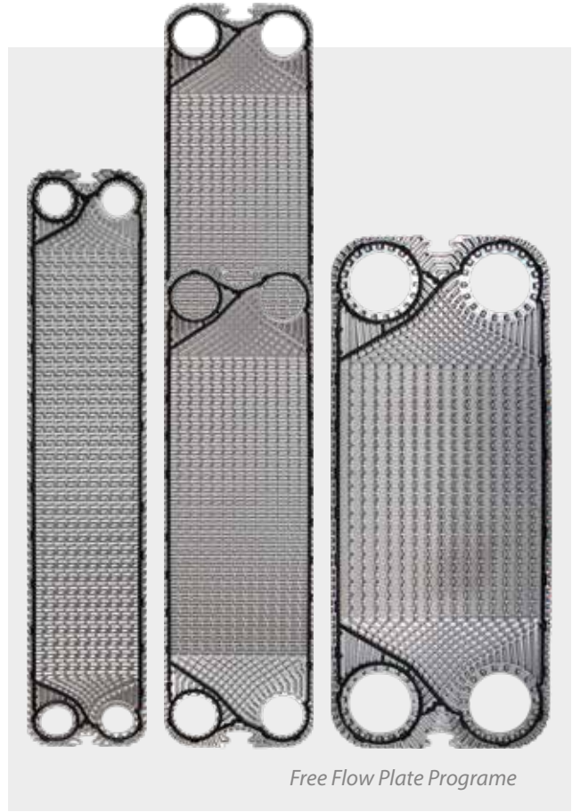
Free Flow Plate Programe

SonFlow's new Free Flow plate heat exchanger series is ideally suited for difficult media containing solids, particles, fibres, and high viscous products. The Free Flow plates corrugation is designed for special tasks, where the conventional plate heat exchanger usually has a higher risk of fouling or clogging.