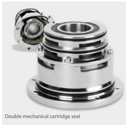
Double mechanical cartridge seal