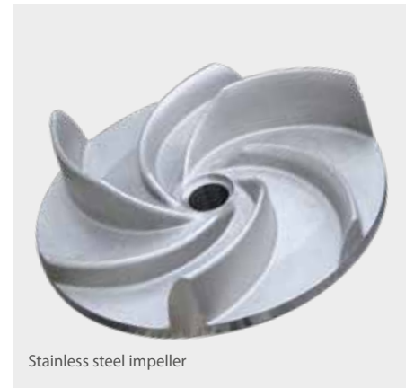
Stainless steel impeller